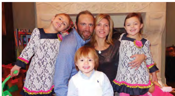
The Beban Family