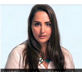
WATCH the video. LEARN the facts. JOIN the movement.

A ten-second version of the public service announcement appeared before