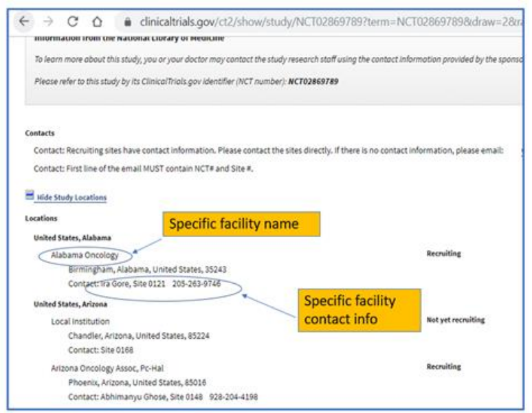
Figure 14: Sites include full name and unique contact information